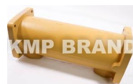
4W 5363 Cooler Core