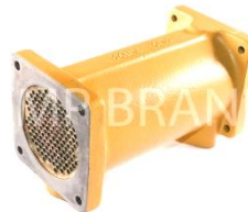
7N 0128 Cooler Core