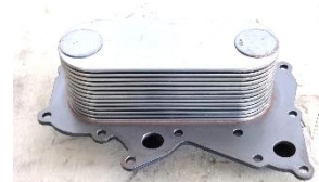
281-7039 Cooler Core