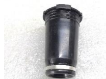
517-8243 Injector Sleeve