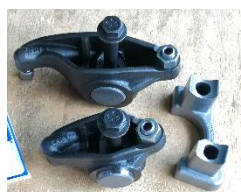
6745-41-5100 Lever Assy