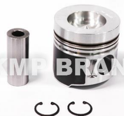
297-7751 Piston w/ Pin