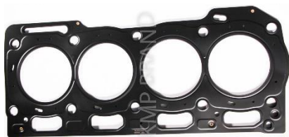
310-8520 Head Gasket