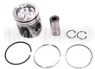
310-9269 Piston Kit