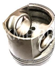
6240-31-2150 PISTON &amp; CLIPS