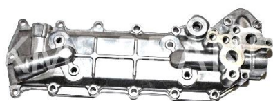
6134-61-2113 OIL COOLER COVER