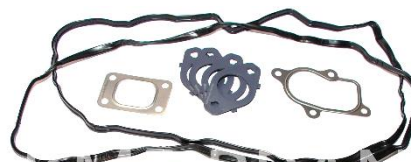
4955356 GASKET KIT UPP